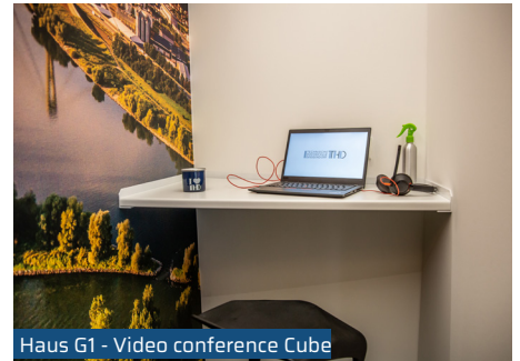
Haus G1 - Video conference Cube