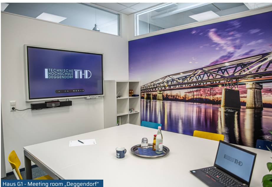
Haus G1 - Meeting room „Deggendorf“