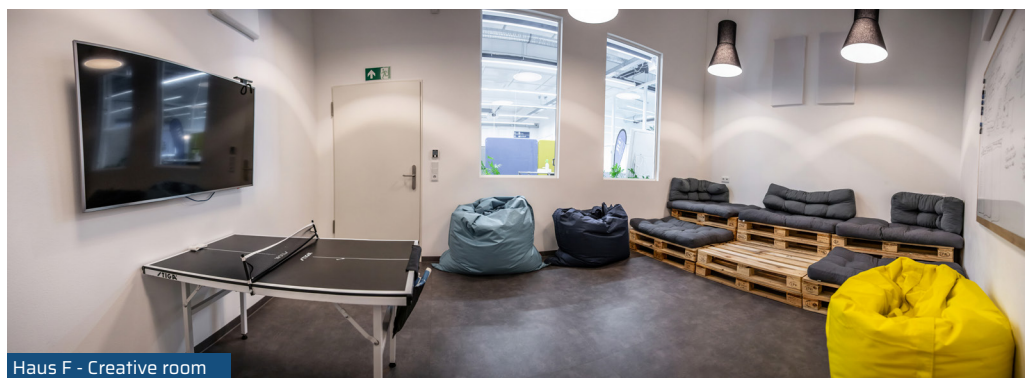
Haus F - Creative room