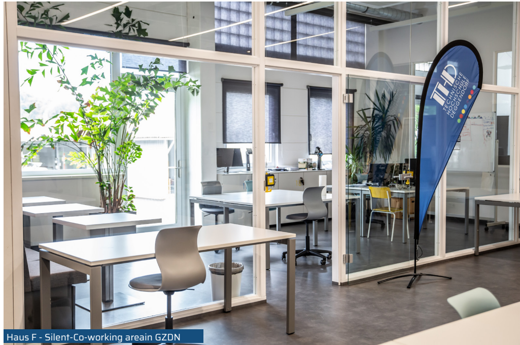
Haus F - Silent-Co-working areain GZDN