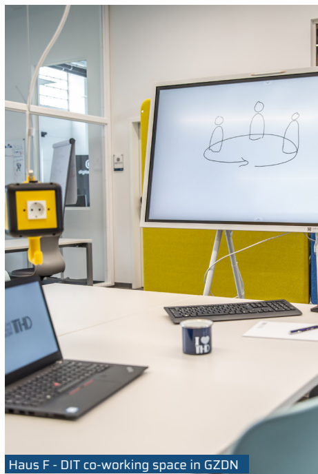
Haus F - DIT co-working space in GZDN