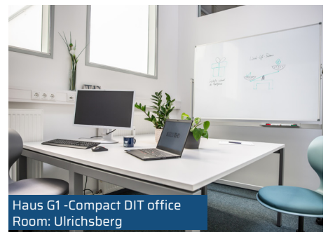
Haus G1 - Compact DIT office Room: Ulrichsberg