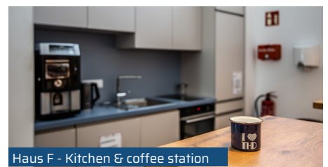
Haus F - Kitchen & coffee station

Find out more about your options at the DIT co-working space.