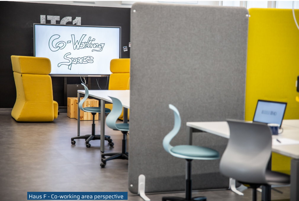
Haus F - Co-working area perspective