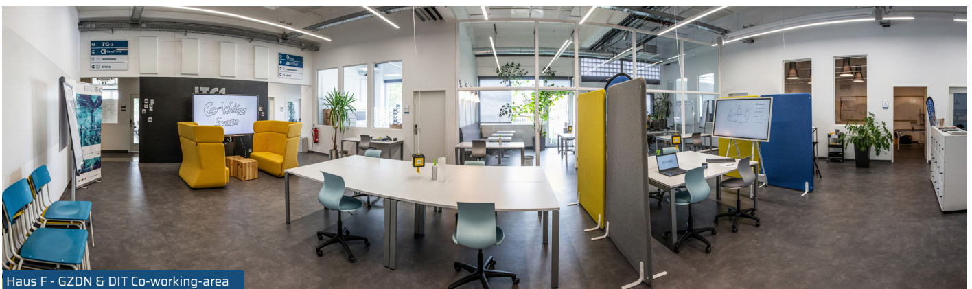
Haus F - GZDN & DIT Co-working-area