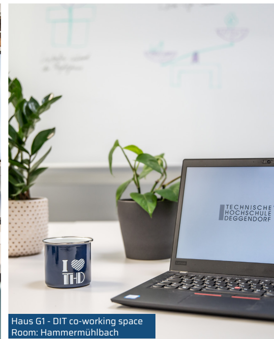
Haus G1 - DIT co-working space Room: Hammermühlbach