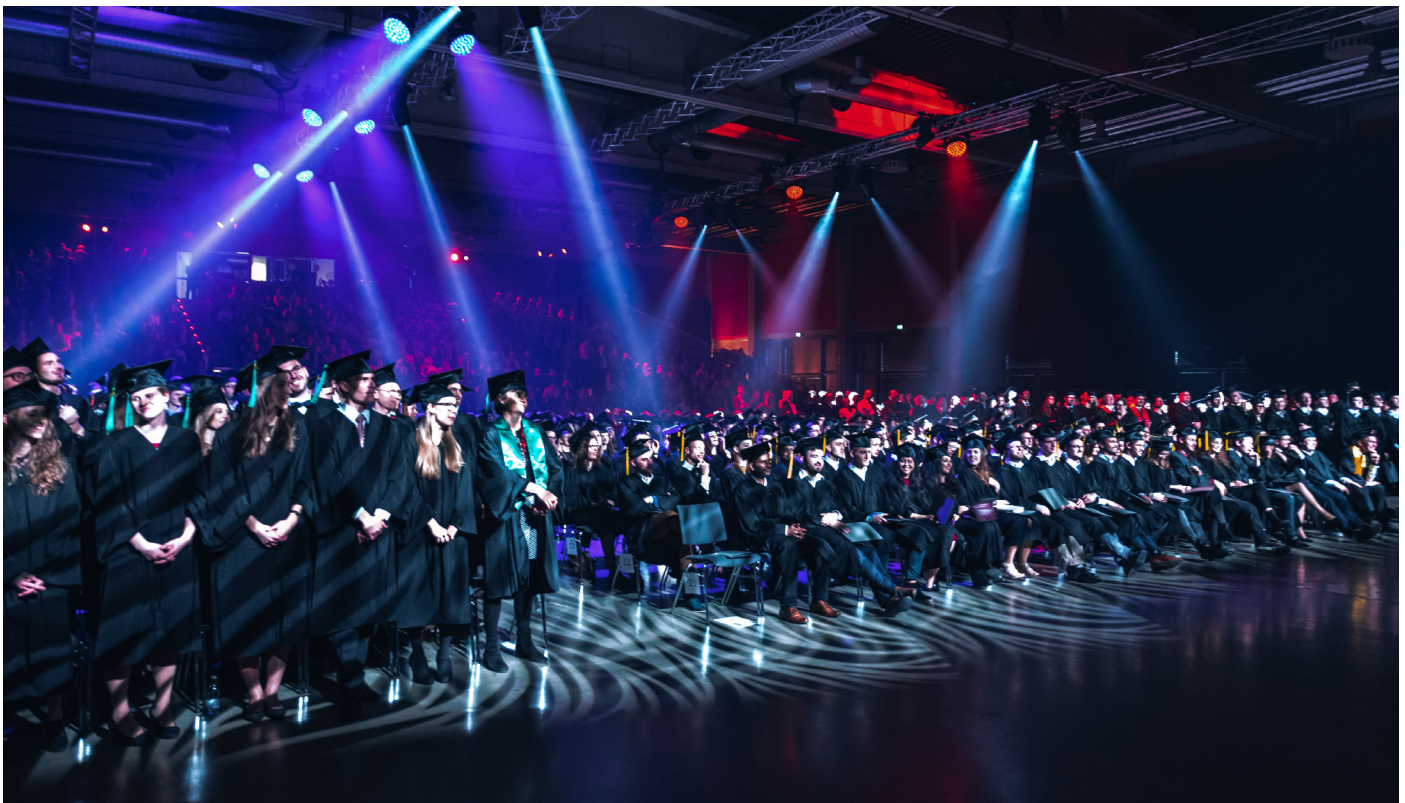
Over 400 alumni - dressed in traditional costumes - were bid farewell by DIT.