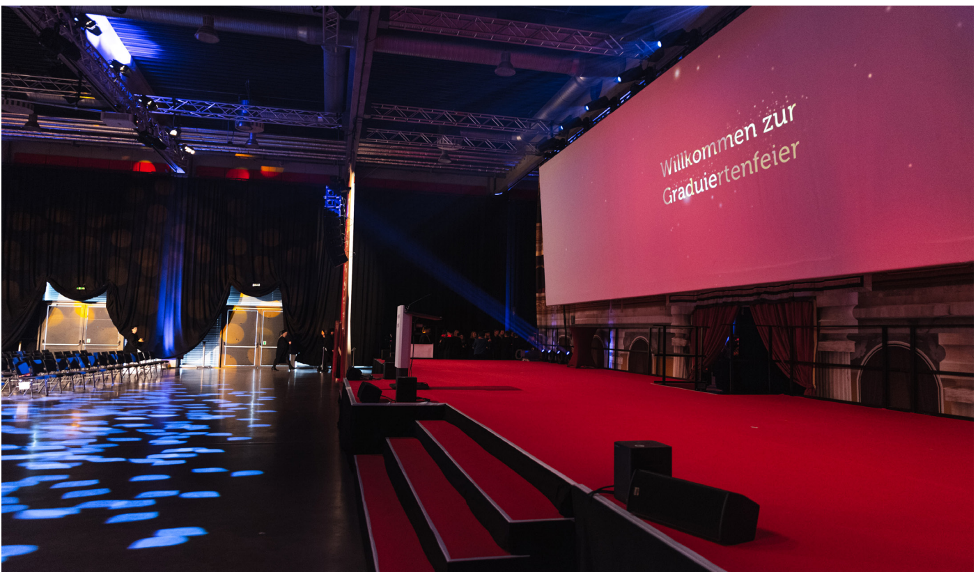
Before the show, the design already impressed with the motto "Hollywood Gala"